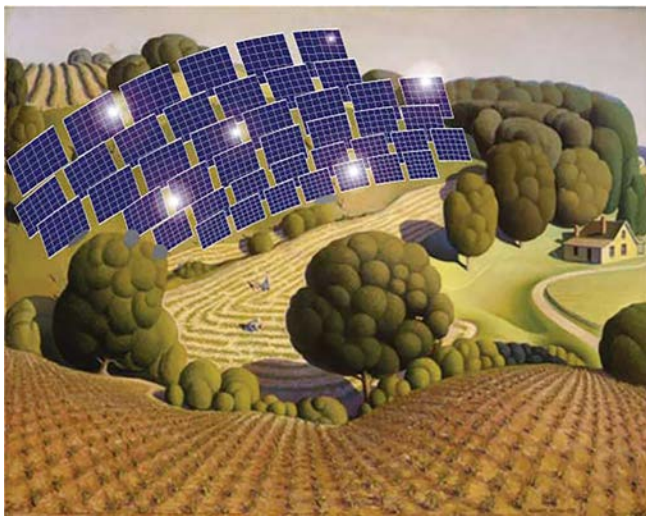
Apologies & Thanks to Grant Wood

☀ Come to your senses at Dionondehowa! ☀