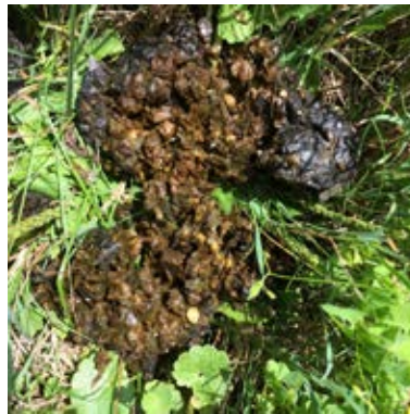
A Bear came through and left this dietary study including lintels that'd been composted.