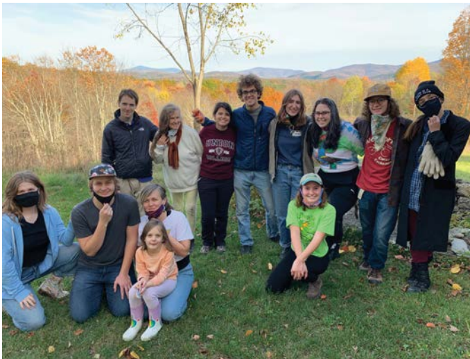
Union College Ozone House Covid-pod and Dionondehowa pod de-masking briefly for this photo on our October 2020 Workday

☀ Come to your senses at Dionondehowa! ☀