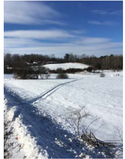
Is this an example of the Presumption of Human Supremacy? A snowmobiler leaves Stanton Road to cross our fields (without permission).