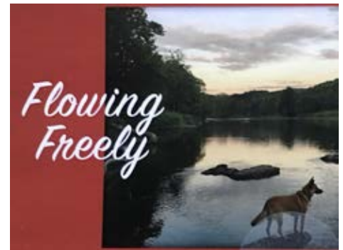
An example of the Presumption of Human Supremacy?