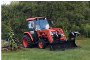
Phil Clark's machine for August 2020 mowing of the Long-grass Nesting fields and pushing back on perimeter succession.