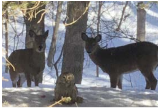
Barred Owl with Rabbit & Deer.