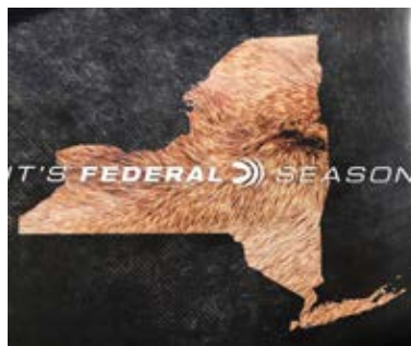
Presumption of Human Supremacy? Ammunition ad in the NYS DEC regs